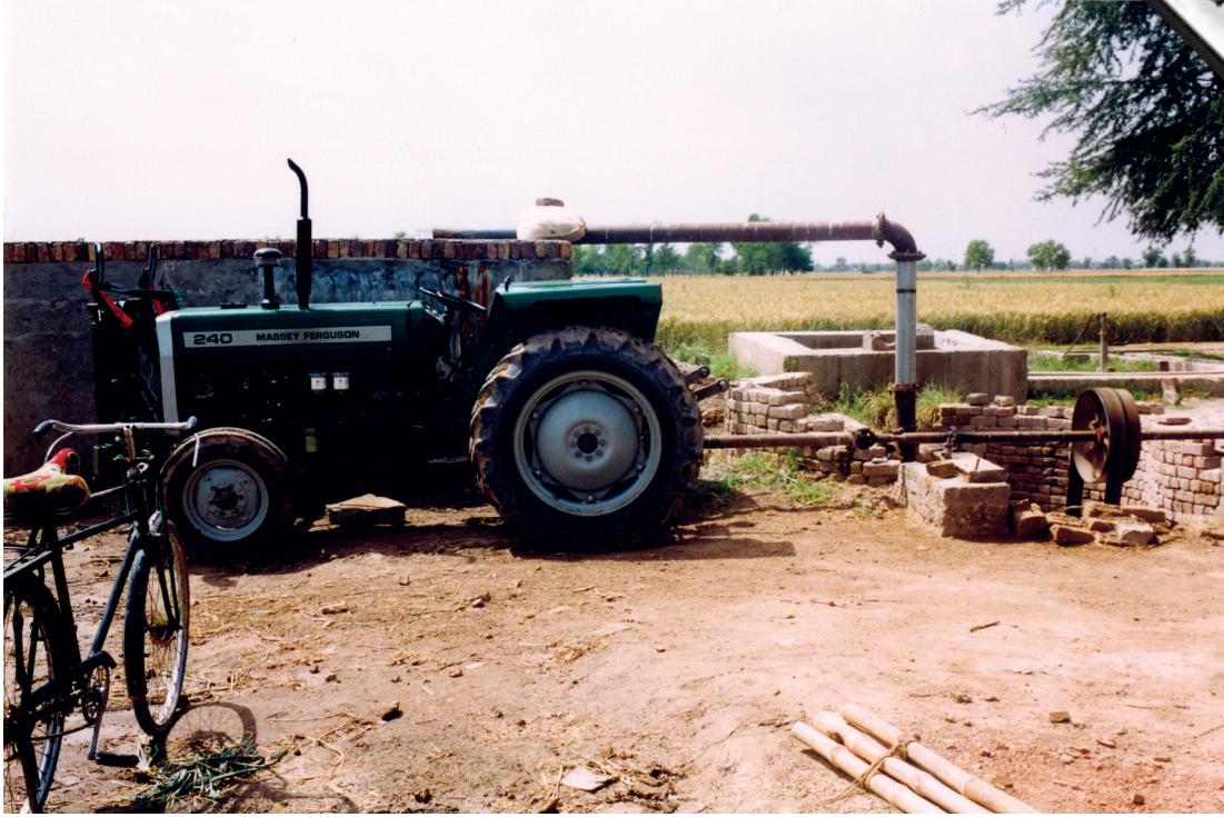
Photograph A for Question 1