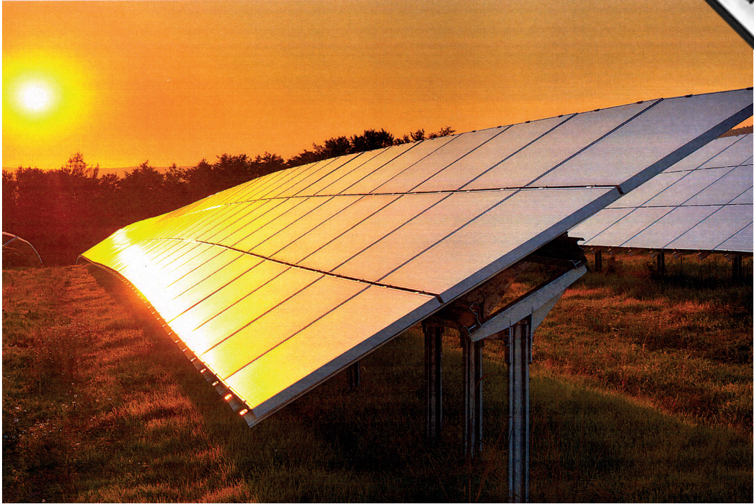
Photograph E for Question 4