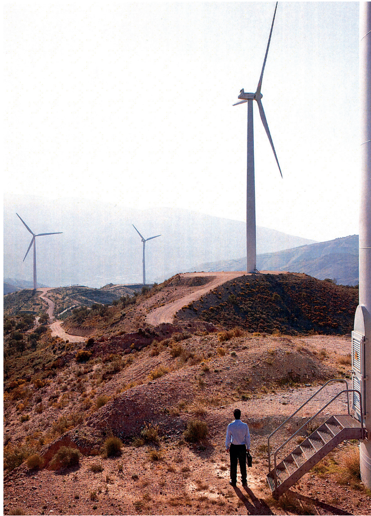
Photograph D for Question 4