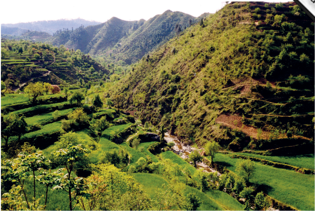
Photograph C for Questions 3 and 4